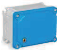
Junction boxes in thermosetting (GRP) with low cover IP68