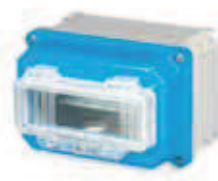
Junction boxes in thermosetting (GRP) with transparent window IP67

Uses: for fixing terminal or modular devices.